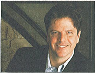
RICHARD PAUL EVANS November 7, 2011

The Tenor of Courage: Known for his stirring performances as a member of the world-famous Irish Tenors and his inspiring personal story of triumph in the face of adversity, Ronan Tynan has beaten great odds to achieve dramatic new heights, time and time again. Tynan is a physician, a champion disabled athlete and a world-class tenor. Despite being born with a lower limb disability and having both legs amputated below the knee at age 20 following a serious car accident, he persevered. Since debuting with the Irish Tenors, Tynan has become nothing short of an international sensation.