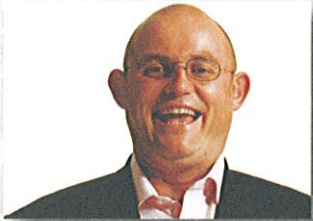
RONAN TYNAN October 10, 2011

The Tenor of Courage: Known for his stirring performances as a member of the world-famous Irish Tenors and his inspiring personal story of triumph in the face of adversity, Ronan Tynan has beaten great odds to achieve dramatic new heights, time and time again. Tynan is a physician, a champion disabled athlete and a world-class tenor. Despite being born with a lower limb disability and having both legs amputated below the knee at age 20 following a serious car accident, he persevered. Since debuting with the Irish Tenors, Tynan has become nothing short of an international sensation.